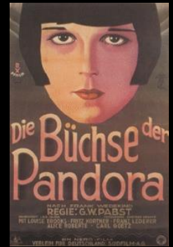
Original 1929 poster